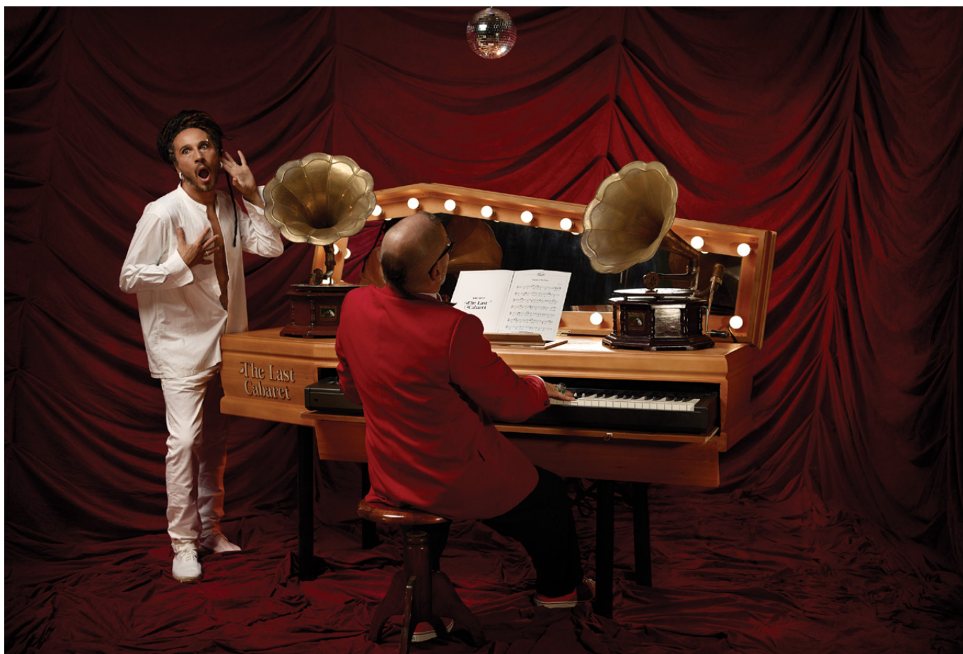
N.8 PIANO - DJ COFFIN - The celebration of life.