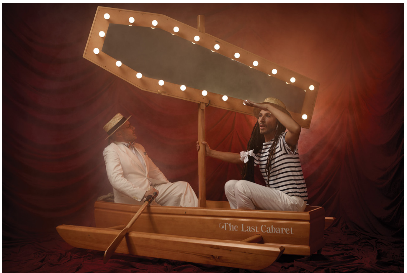
N.4 BOAT COFFIN - We are heroes and protagonists of our own adventure.