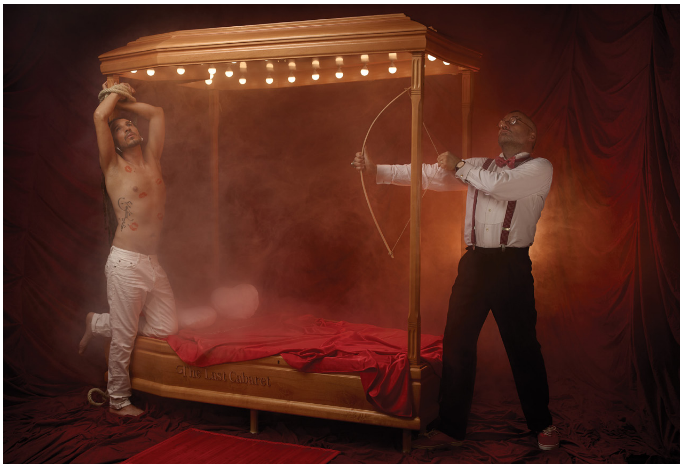
N.5 DOUBLE BED COFFIN - Eternal love. Living and loving, loving and dying.