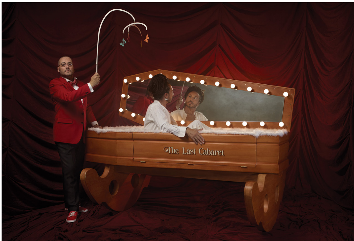
N.12 CRADDLE COFFIN - Rebirth.