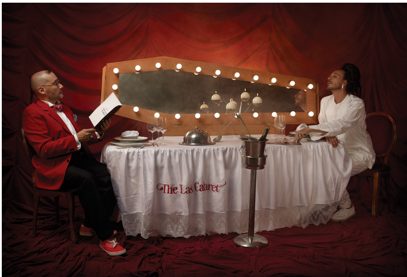
N.10 BANQUET COFFIN - The banquet of life. To eat or not to eat. To be or not to be.