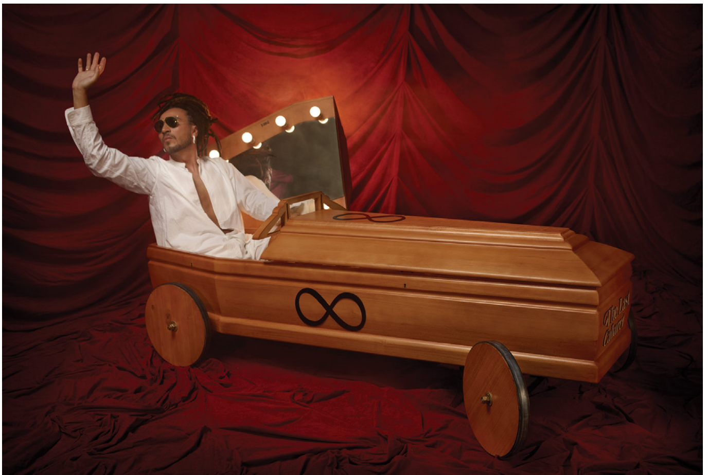
N.2 TOY CAR COFFIN - Any time in the past was better.