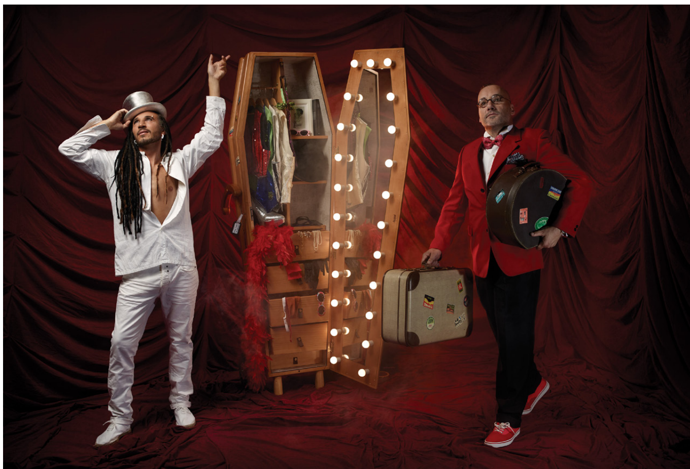
N.6 TRAVEL TRUNK COFFIN - The trip of life and its luggage.