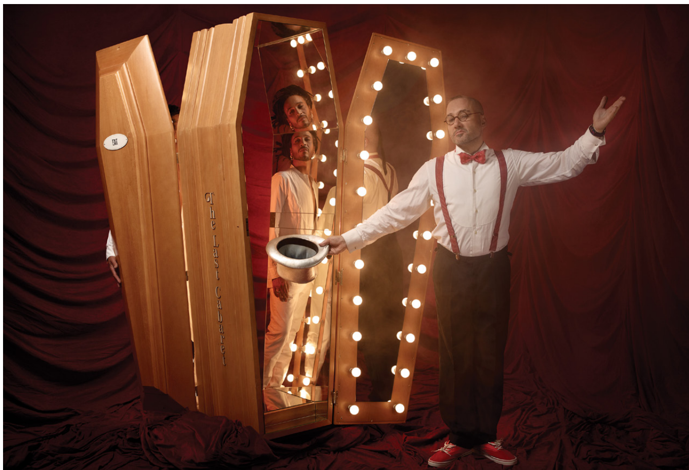
N.9 MAGIC COFFIN - Trespassing is transcending.