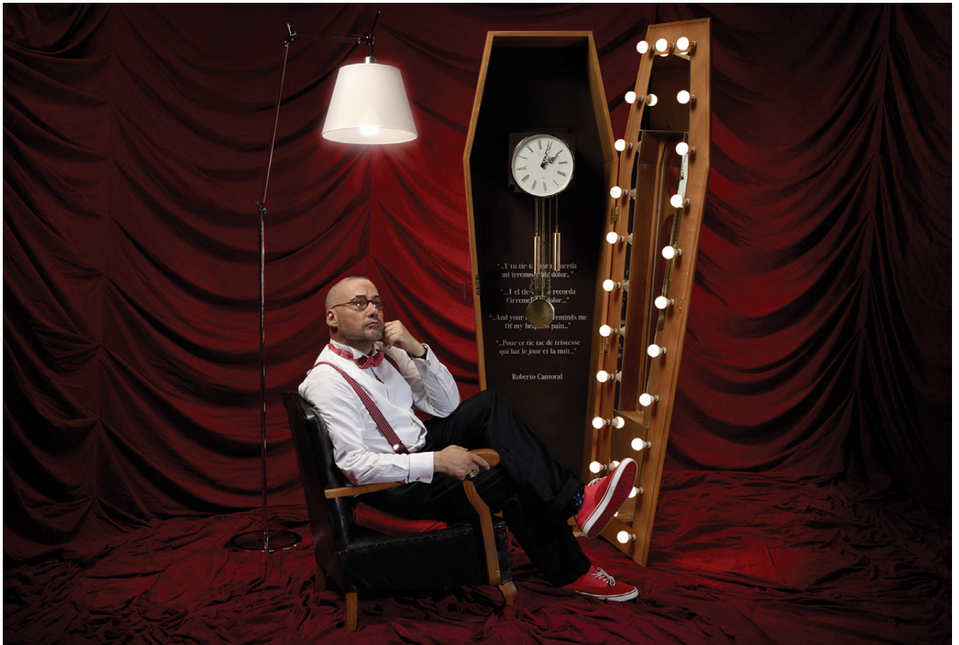
N.1 CLOCK COFFIN - The inexorable passing of time and the illusion of being able to stop it.