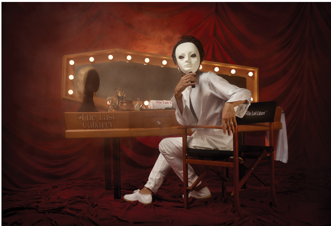
N.11 DRESSING ROOM COFFIN - Vanity of vanities; all is vanity.