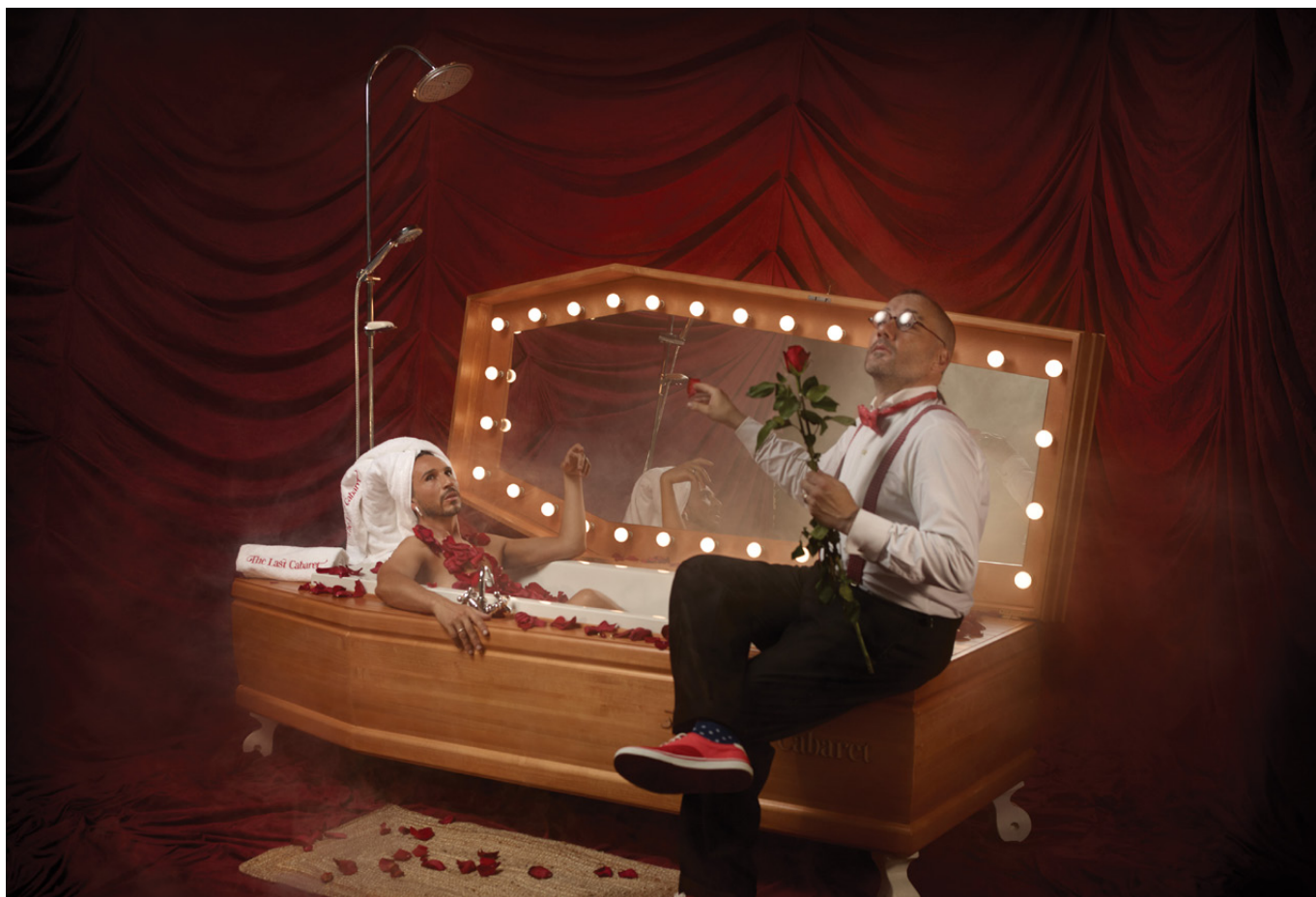
N.7 BATH COFFIN - Expiation of guilt, purification, pain healing.