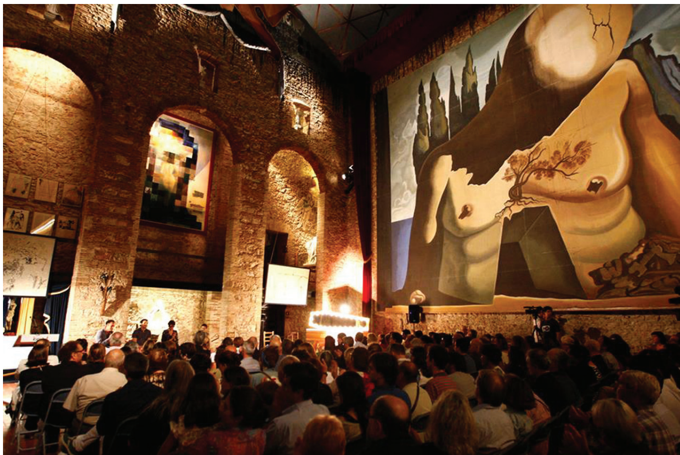
Presentation at the Dalí Museum in Figueres.