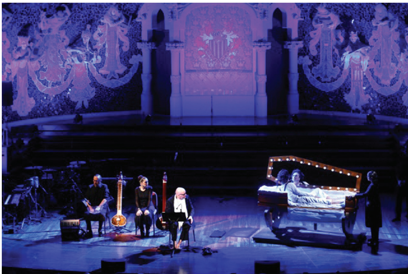
Poetry reading at the Palau de la Música Catalana in Barcelona (Photo: Cristobal Castro).