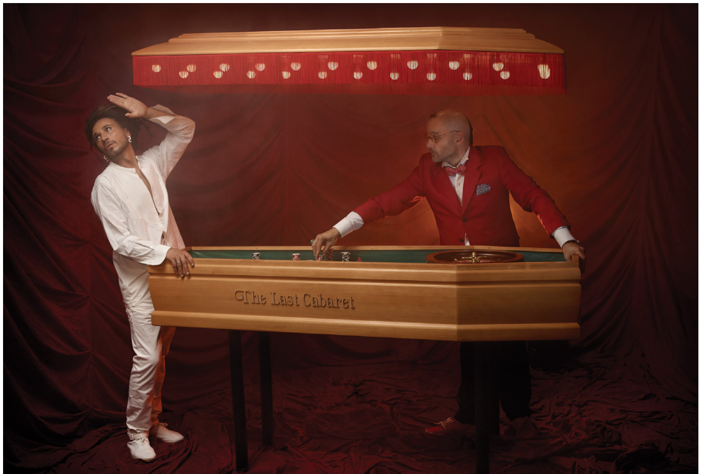
N.3 CASINO COFFIN - The wheel of fortune spins the same way for us all. Ladies and gentlemen, place your bets!